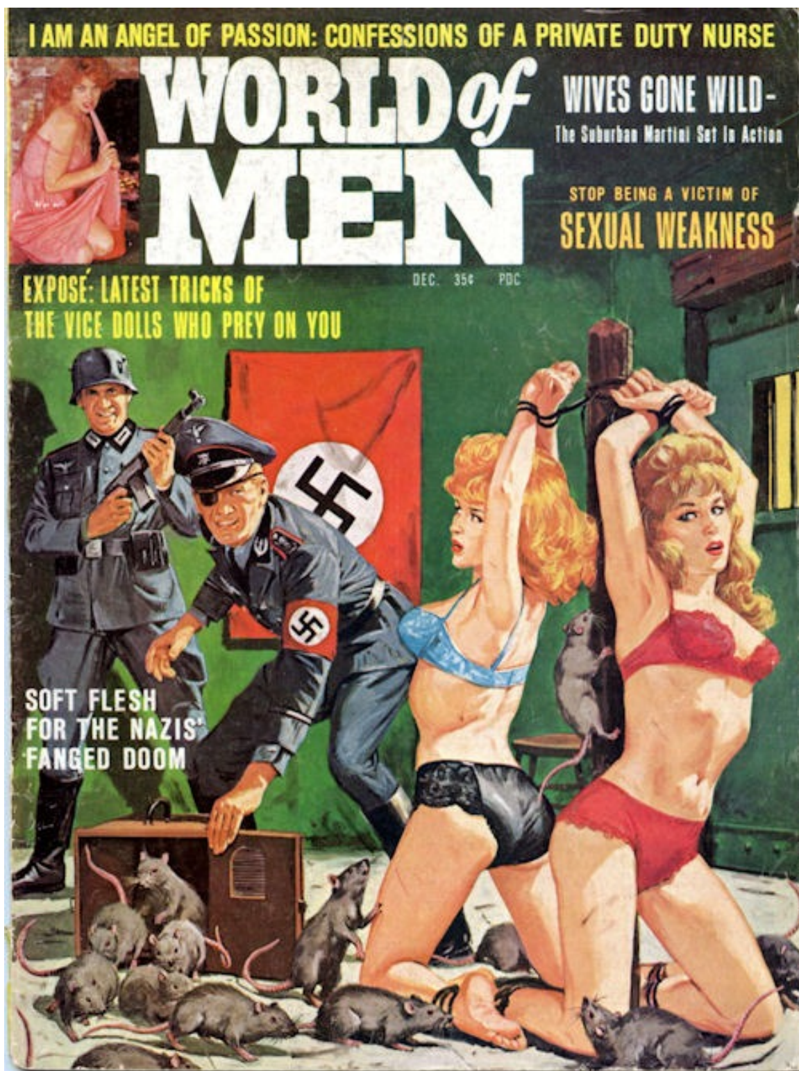
"Soft Flesh for the Nazis Fanged Doom." World of Men , vol. 2, no. 5 (December 1964).