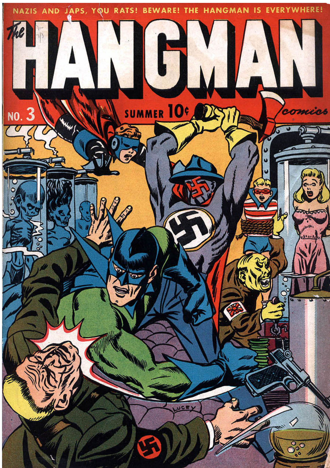
Not a men's adventure magazine, but a possible genre precursor. Hangman Comics #3. (June 1942). Cover penciled and inked by Harry Lucey.