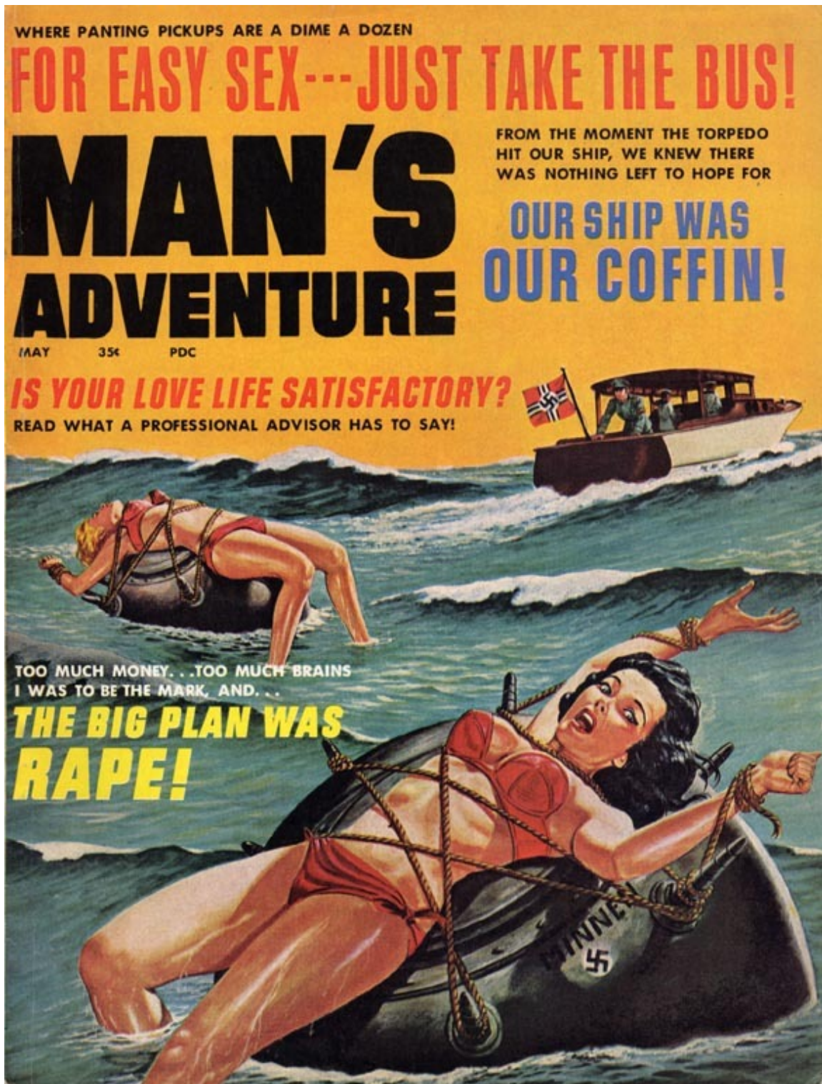
"Our Ship Was Our Coffin." Man's Adventure . Vol. 8, no. 7. (May 1967).