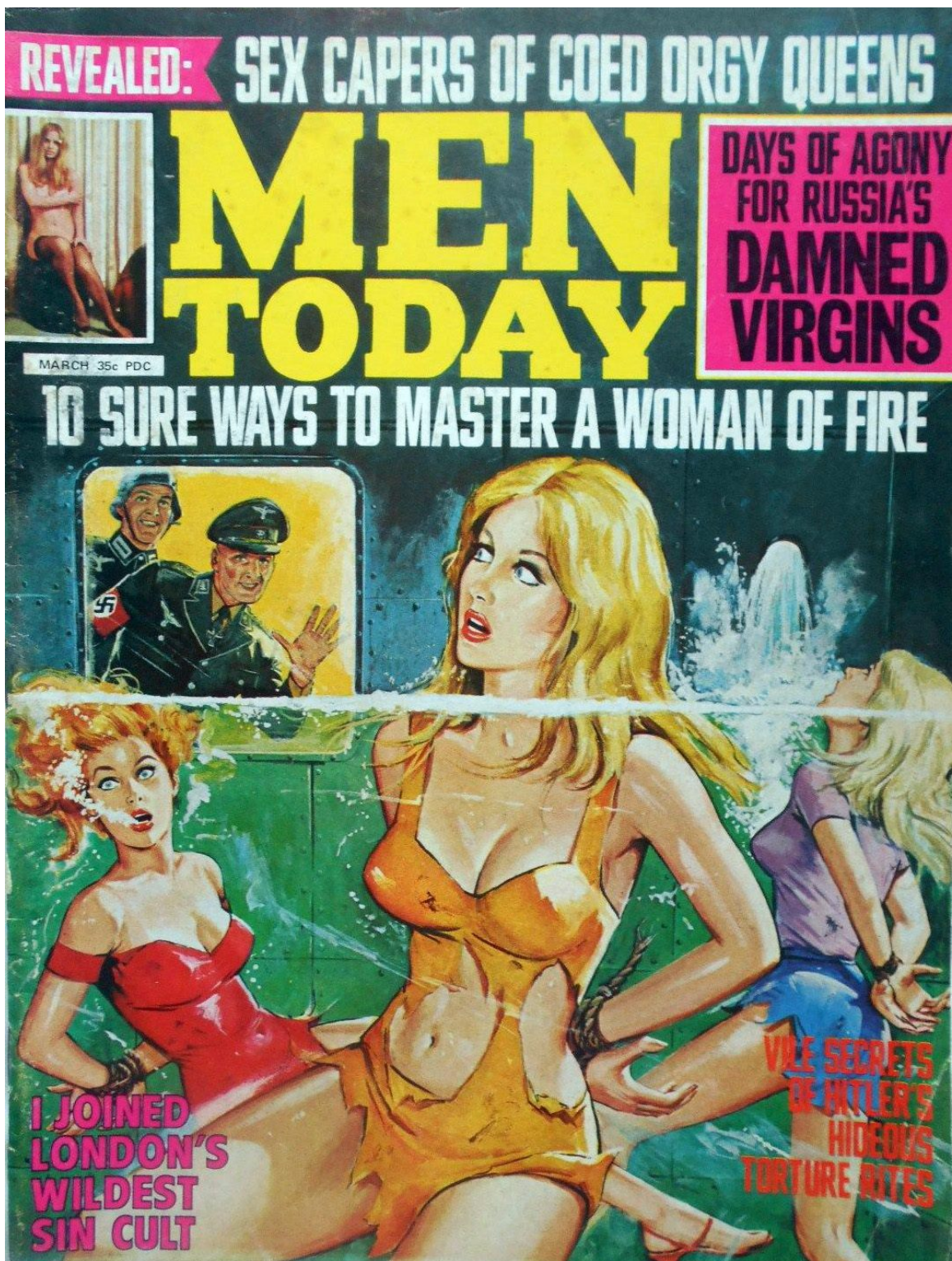
"Vile Secrets of Hitler's Hideous Torture Rites." Men Today , vol. 9, no. 2 (March 1970).