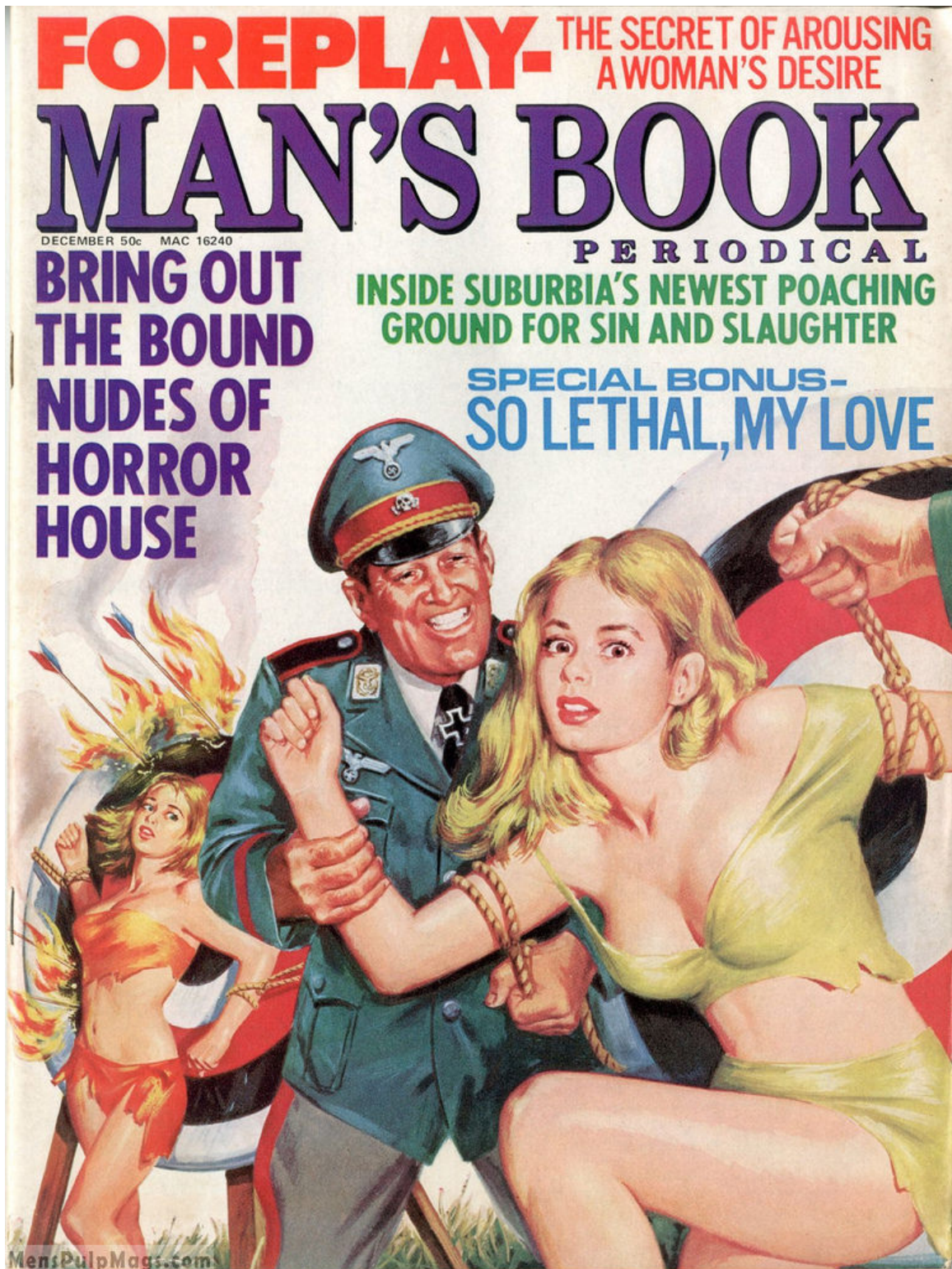
"Bring out the Bound Nudes of Horror House." Man's Book Periodical , vol 11, no. 6 (December 1972).