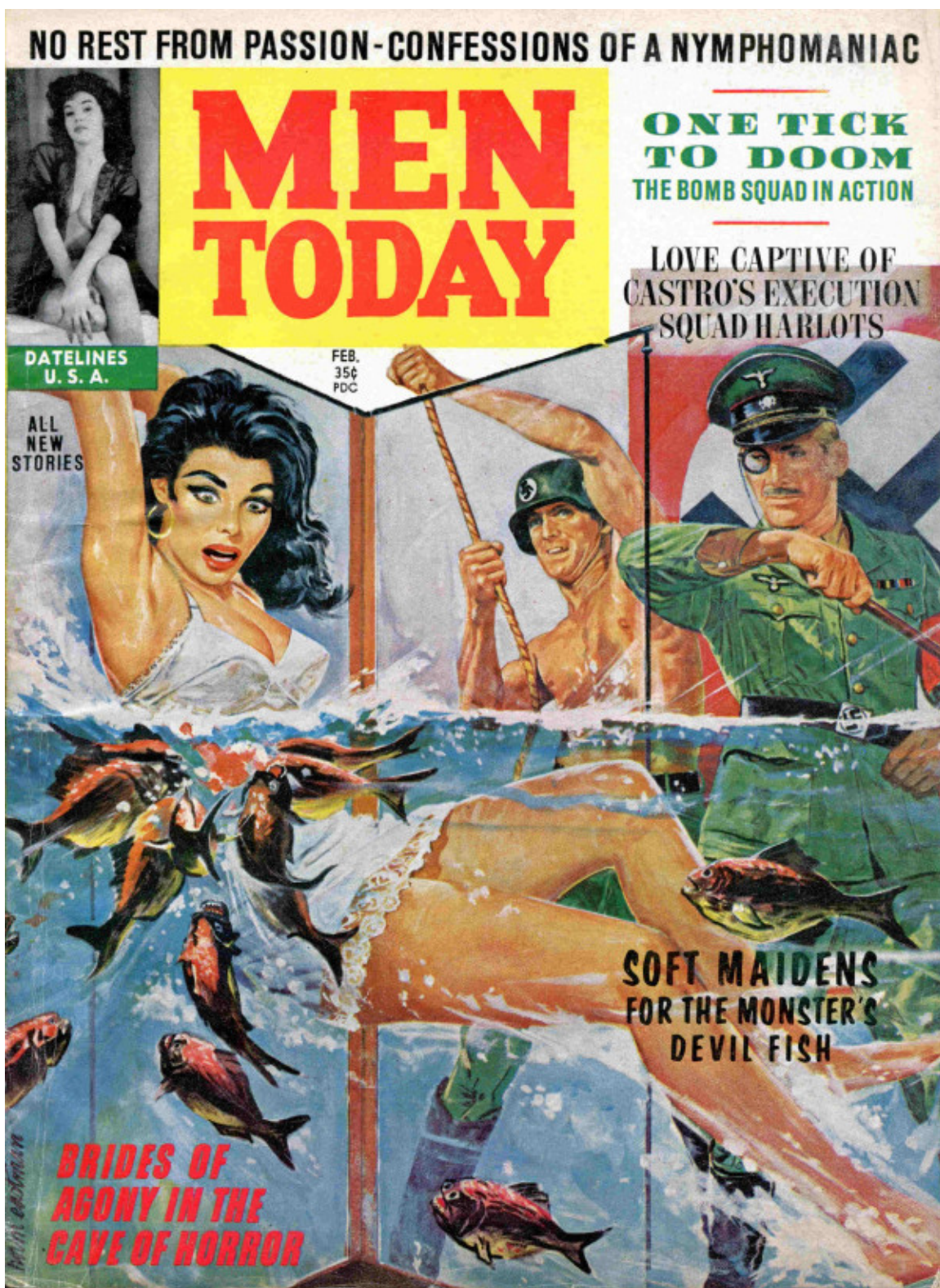
"Soft Maidens for the Monster's Devil Fish." Men Today , vol. 3, no. 2. (February 1963).