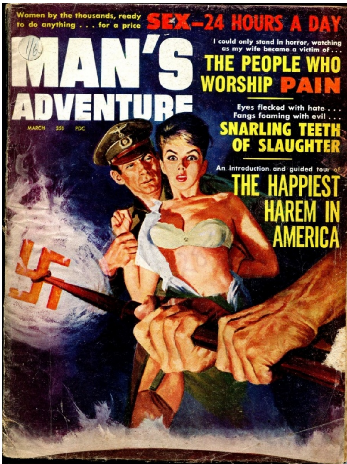
Man's Adventure , vol. 4, no. 5 (March 1963)